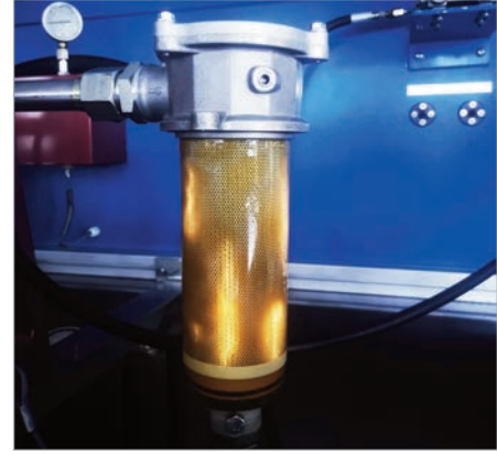
Fig.4 Electrostatic discharges tested in our R&D Department